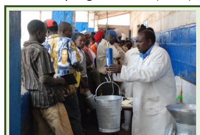
Milk safety checks are carried out at collection centres

Another key part of SDP's policy-influencing strategy was to identify and foster links with civil society organisations (CSOs) 2 , who provided capacity to engage in policy advocacy and who championed SDP's policy recommendations. To assist in this process, ten evidence-based policy briefs were prepared which included the demand for dairy produce in Kenya, employment generation, competitiveness of smallholder dairy enterprises, public health issues, and improved child nutrition due to milk consumption.