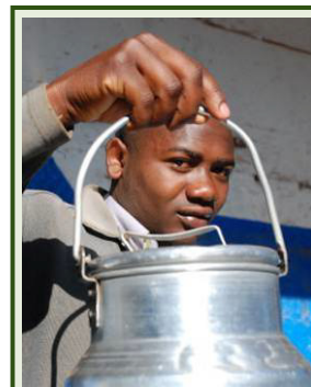
Kenya's informal milk sector dominates the milk marketing chain

CSOs continued to lobby decision-makers and parliamentarians for support, which resulted in an increased profile for the SSMVs and widespread acceptance of their importance in the