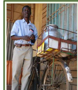
Hawkers have been trained and are now certified

As part of the on-going development of pro-poor strategies for smallscale milk market development, the new Dairy Traders Association (DTA) of Kenya was officially launched in September 2009. Its aims and activities include self-regulation based on the training and certification concept originally developed by SDP and further scaled up by SITE (Strengthening Informal Sector Training and Enterprise). Around 4,000 SSMVs, offering employment to over 10,000 people, have been trained and certified by the Kenya Dairy Board (KDB) through the association. Field regulators also ensure that licensed outlets and premises operated by SSMVs meet conditions for milk hygiene, testing requirements and sanitation, and operators know how to comply with these conditions.